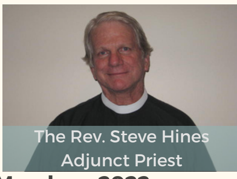
Church of the Good Shepherd Vestry Members 2022