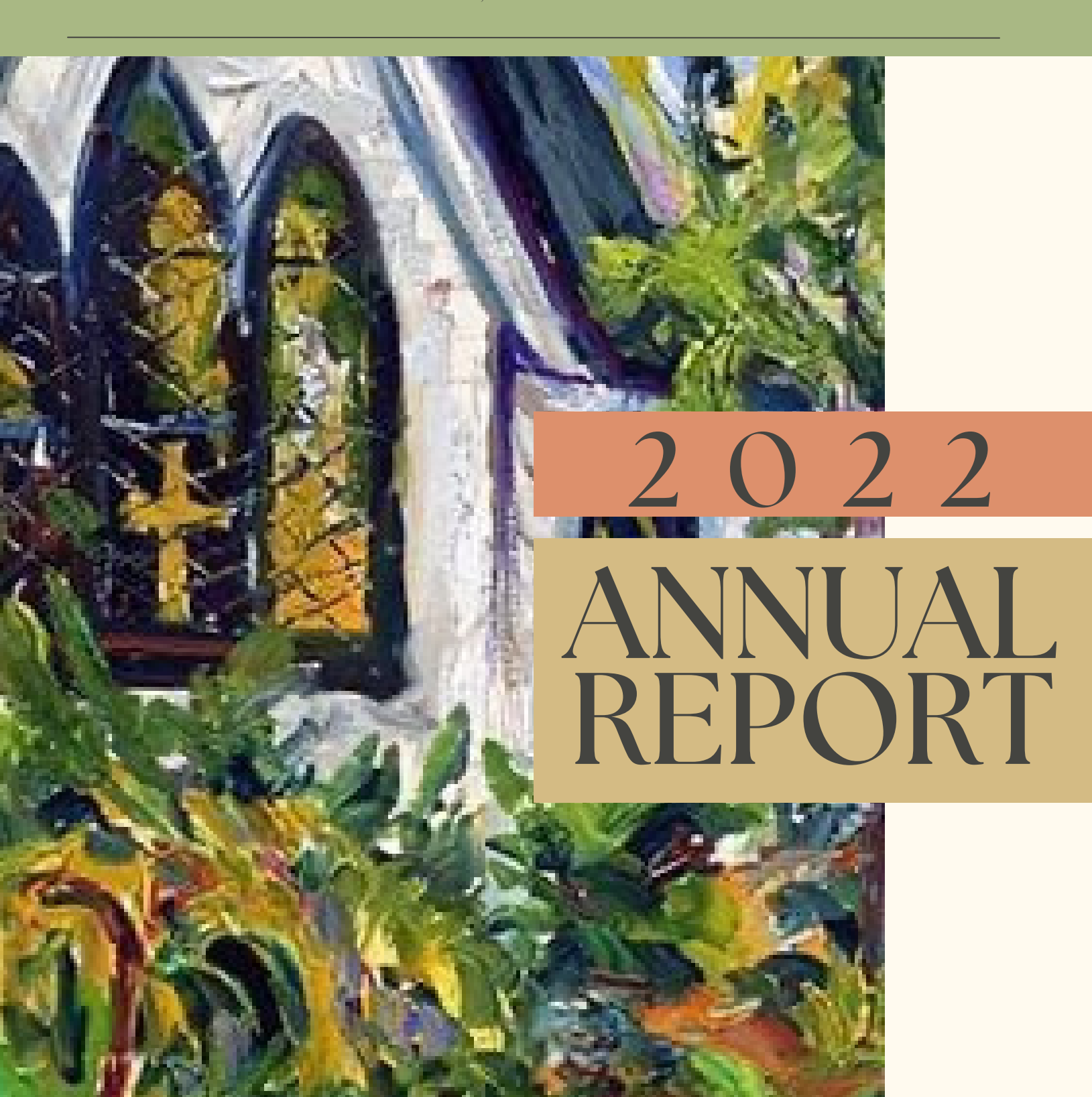
Mission Statement: "To reflect God's love through our faith in action!"