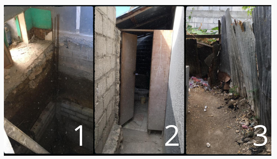
CURRENT NEEDS OF BON BERGER

<u>Photo 1:</u> A new hole that we are drilling for the new sanitary block for the School