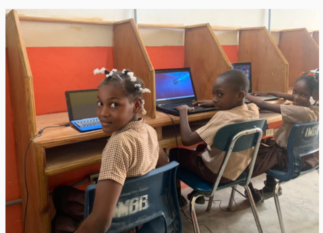
High school students in Florida raised money to buy desks and 12 computers! They are having trouble getting internet service though.