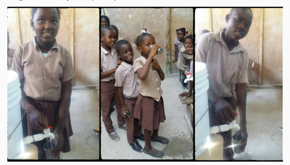
CLEAN DRINKING WATER!

Several years ago funds were raised to set up a water filtration system. Look at these children enjoying the safe drinking water that your generosity helped provide!