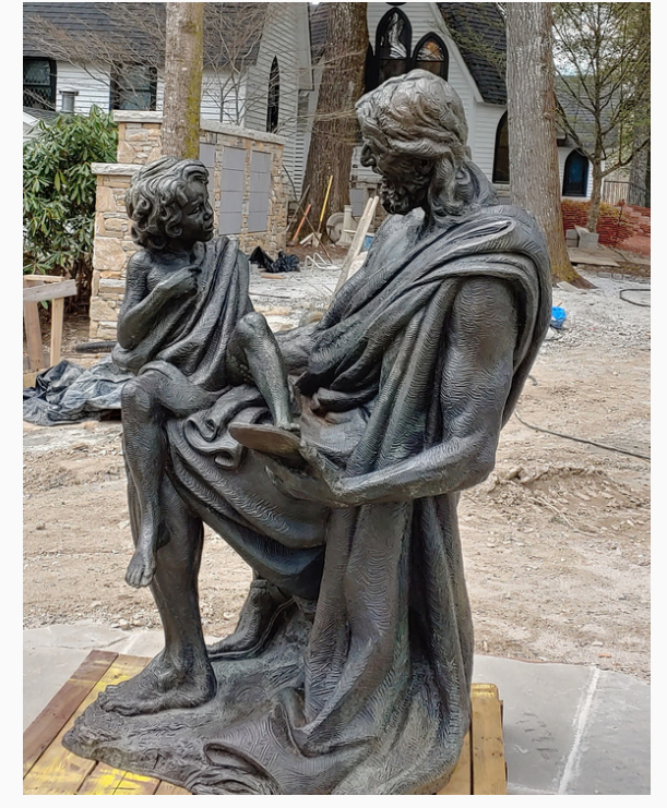
"CHOSEN", A SCULPTURE OF JESUS AND CHILD BY WESLEY WOFFORD

CASKET BURIAL $3,000 (SPACE FOR 2 CASKETS)