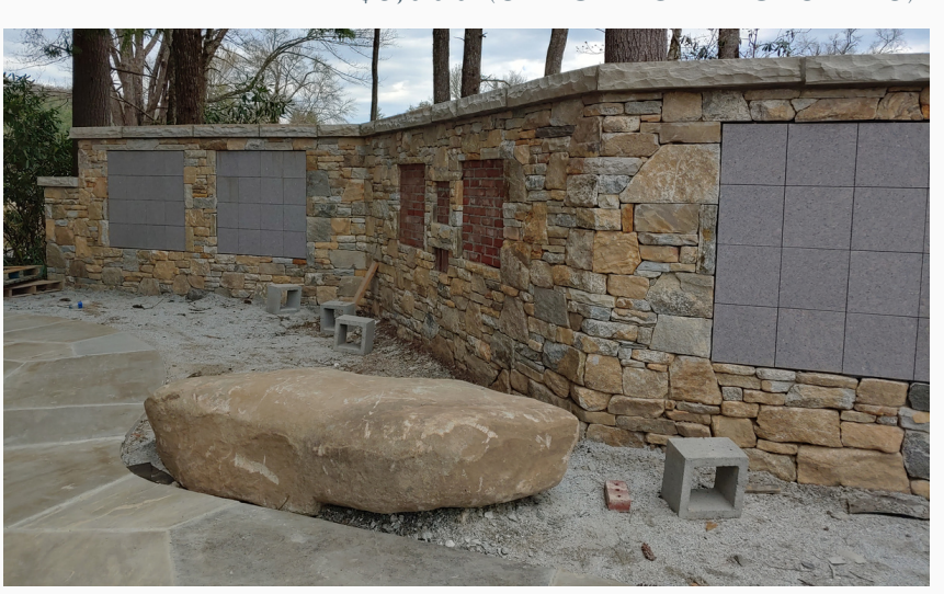
MEMORIAL GARDEN WALL WITH NICHES