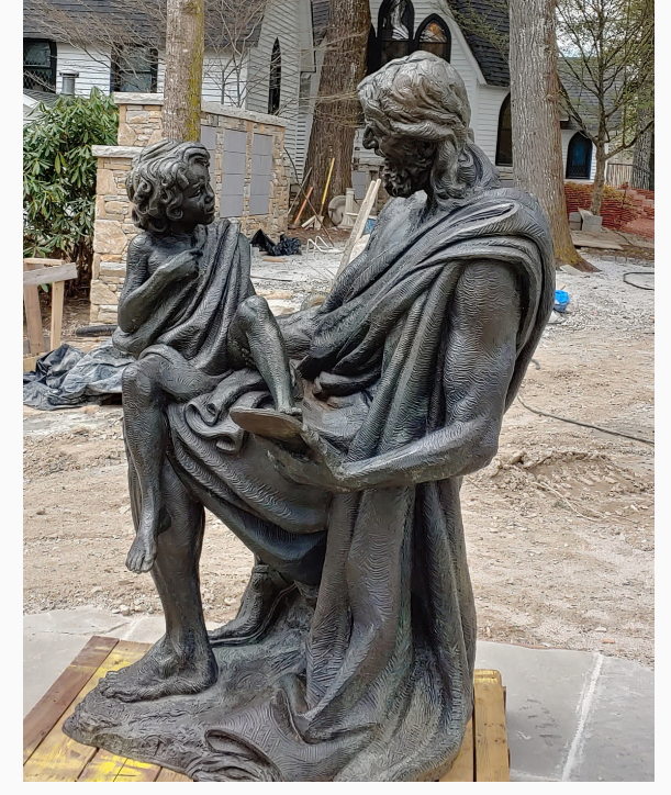
"CHOSEN", A SCULPTURE OF JESUS AND CHILD BY WESLEY WOFFORD

CASKET BURIAL $3,000 (SPACE FOR 2 CASKETS)