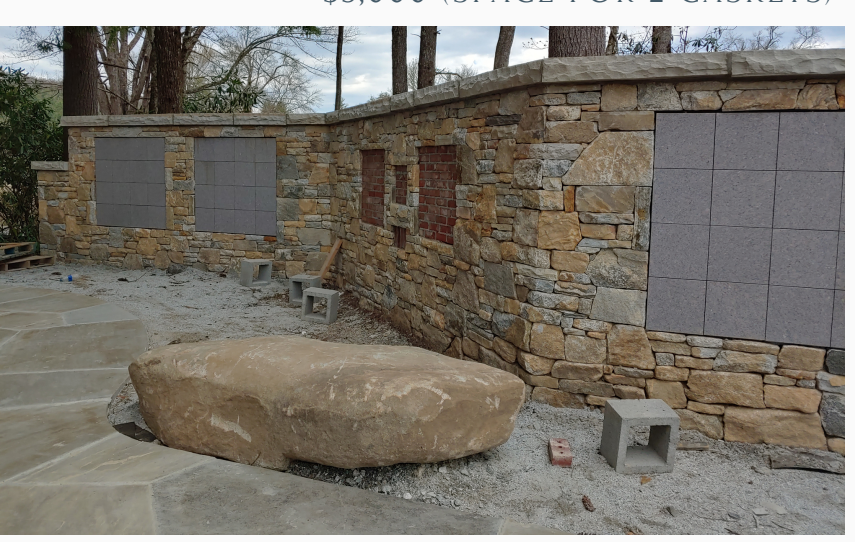
MEMORIAL GARDEN WALL WITH NICHES