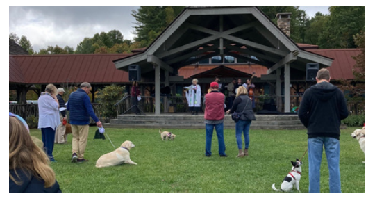
Thank you to everyone who came out for the Annual Blessing of the Animals. Despite an approaching hurricane that brought rain & wind we enjoyed music and fellowship with many amazing pets and their wonderful human companions.