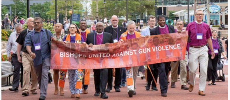
Bishops from across the country marched in Baltimore during General Convention.

1980s for self-identification and the calling of a bishop