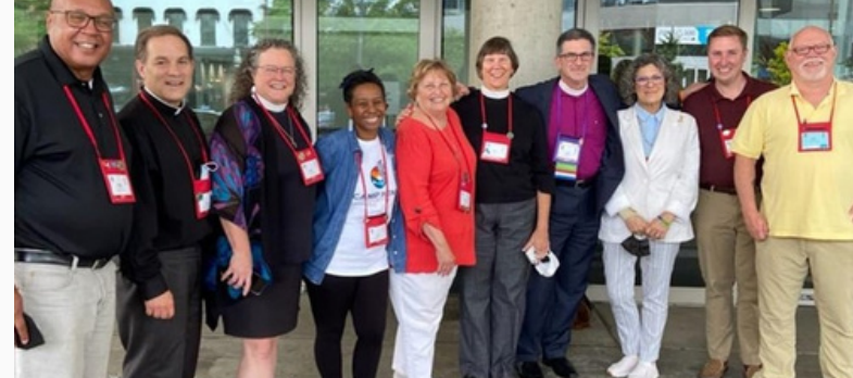
The delegation from the Diocese Western North Carolina traveled to Baltimore for the 80th Triennial convention of the Episcopal Church in America.